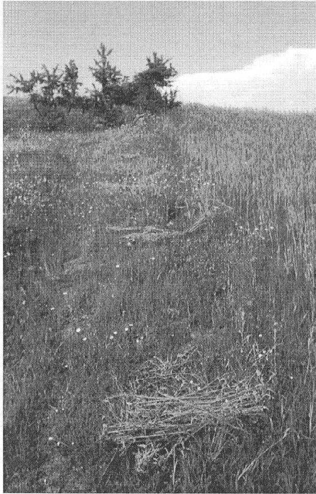
Figure 3. Corn cockle ( Agrostemma githago ) pulled up from the edge of a cornfield in Macedonia (May 8, 1998).

ronmental conditions such as prolonged frost periods and flooding may also be responsible for yield losses. Even complete harvests may be destroyed in this way. Barley has a shorter life cycle than wheat and can be sown when the growing season is short. Some current barley varieties even have a very high salt tolerance, but it is not clear whether such varieties were already selected in the early Neolithic. Another advantage of barley over primitive wheat species such as einkorn and emmer could have been the higher ratio of harvested to sown grain kernels, at least when six-row barley was grown. The number of grain kernels that is produced on each rachis node is three in six-row barley, whereas einkorn produces one grain kernel and emmer two grain kernels at each rachis node. To determine the seed return ratio for a complete harvest is, however, rather complicated, as it depends on many parameters, including the number of rachis nodes per ear (which may vary considerably), tilling capacity, and the trade-off between grain numbers and grain weight (Evans 1993, 260–64).